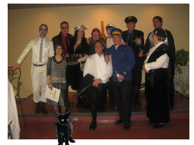
2008 Mystery Night Cast: "To Wake The Dead"

*For more information and link to the event, see our Special Events page.